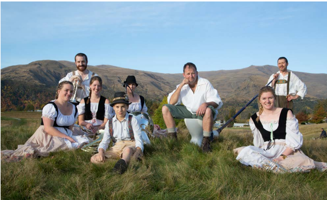
On Saturday 26 April a small group of St Kilda players provided entertainment at the national final of the Mercedes Trophy golf tournament at Millbrook Golf Resort. A fun night was had by all with the porcelain alpenhorn making an appearance.