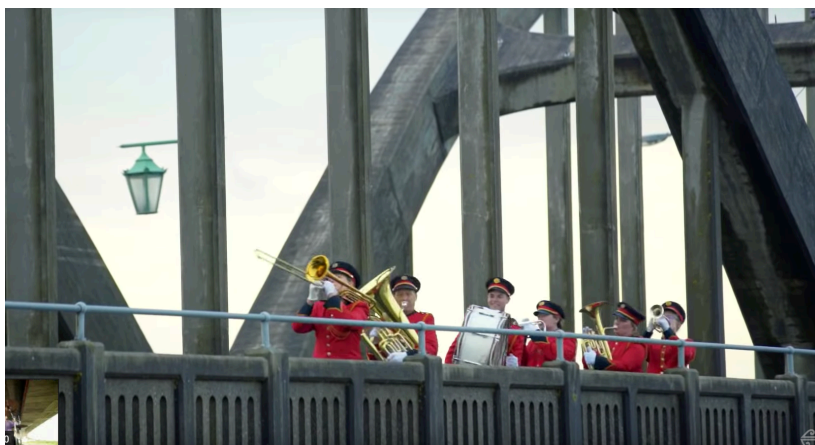
The Saints debut in the new Air New Zealand safety video

2018 Band awards, new players, fond farewells and upcoming events!