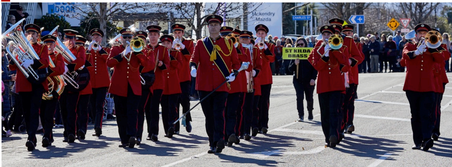
St Kilda Brass Street March during the 2018 National Brass band Championship held in Blenheim